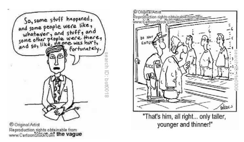
Fig. 4 – Vagueness and Descriptions.

expedient in order to specify the meaning of a term: it remains definitively vague. From the standpoint of these definitions, we don't learn how to use the defined term, or how to identify pain. Vague descriptions are not informative (cf. fig. 4), nor helpful in understanding the real meaning of pain, first of all from patients' point of view.